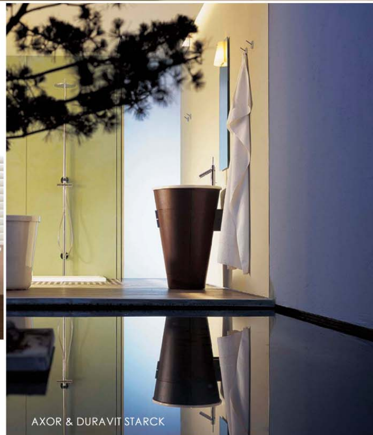
AXOR & DURAVIT STARCK

Combine elements like water, natural lighting, stones, plants, wood and sand. Creating harmony with nature.