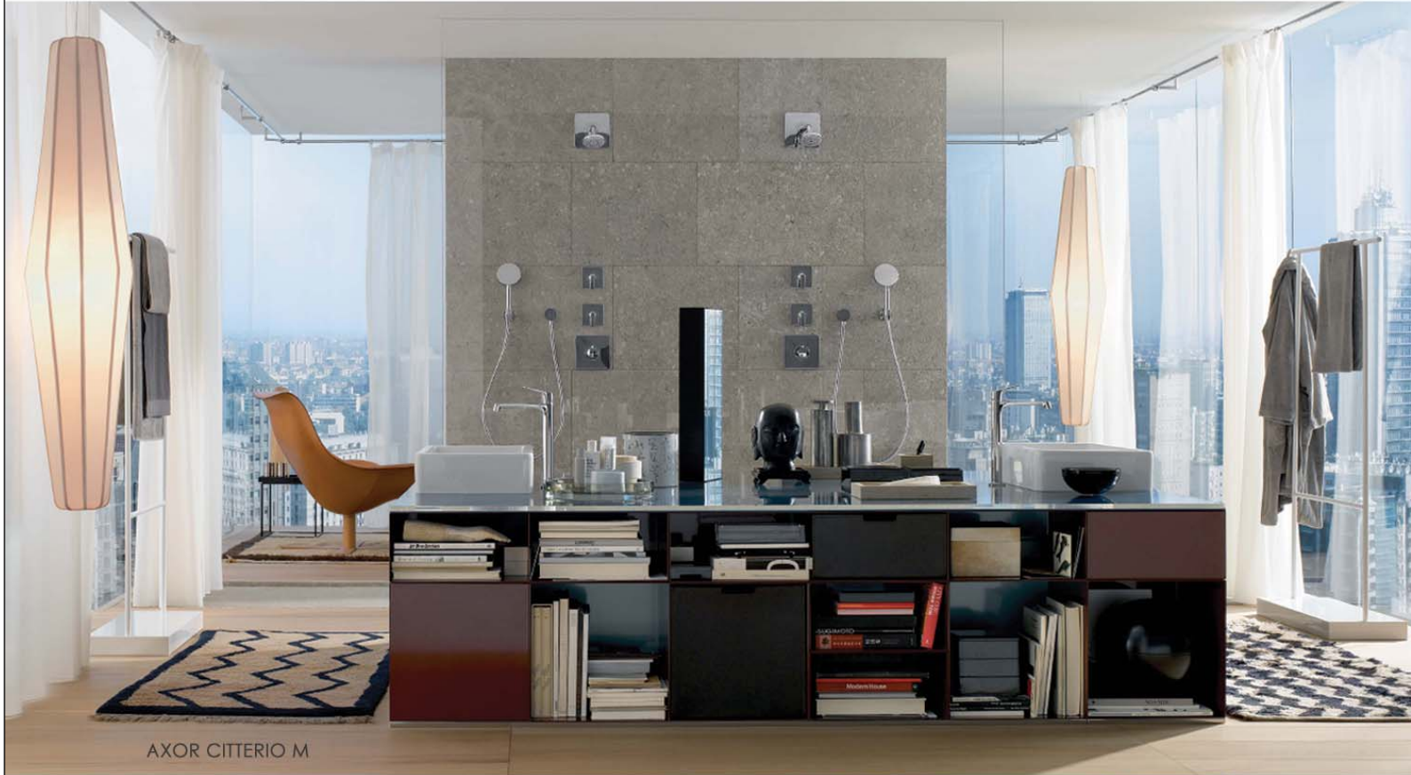
AXOR CITTERIO M