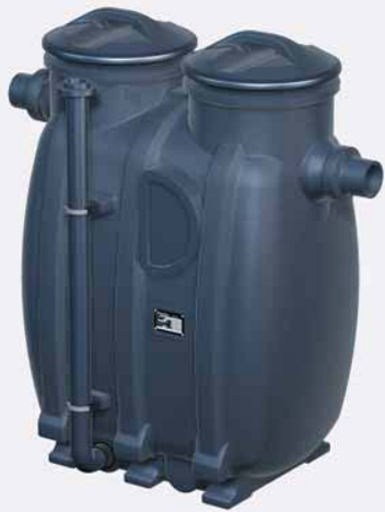
Art. # 93 002.00 / D1 Version in flow direction right